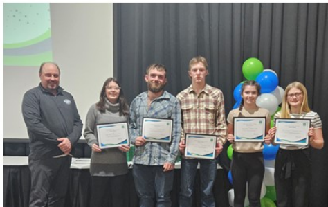
National Member Forum (Toronto, ON-) Travel Participants