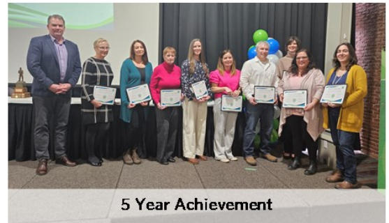
5 Year Achievement