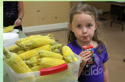
Club Corn Boil