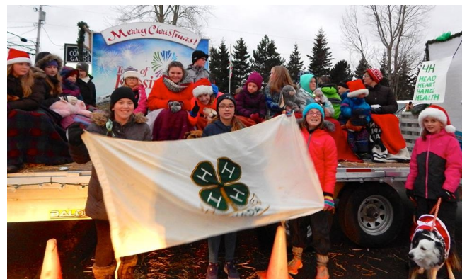
Members of the Kensington 4-H Club on the float they decorated for the parade.

Kensington 4-H Club - Kudos to the members, parents, and leaders of the Kensington 4-H Club for putting together this great 4-H themed float for the 2017 Kensington Christmas Parade on the evening of December 3, 2017. Big thanks to Veseys Seeds for the loan of their trailer! The funding for their new club banner and float decorations came from 4-H Canada's 4-H Connecting Canadians Fund, and is supported by the Government of Canada and generous partners, TransCanada and McDonald's Canada.