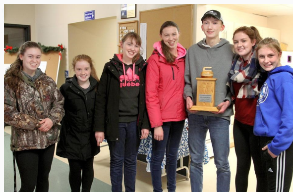
Please visit www.facebook.com/NorthRiver4H/ for more photos of this fun 4-H event.