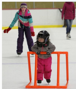
Future 4-H'er at the Christmas