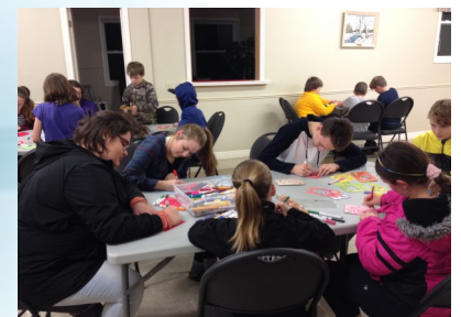
Creating Christmas Cards for Veterans