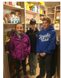
Food Bank Donation