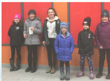
Smiling faces enjoying refreshments following the District Swim!

Thank you to the The Dunstaffnage-Marshfield and Wheatley River 4-H Clubs for organizing this event.