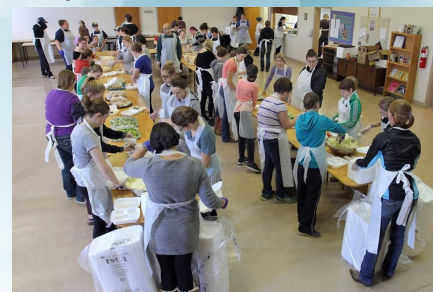
Annual Roast Beef Take-out Dinner