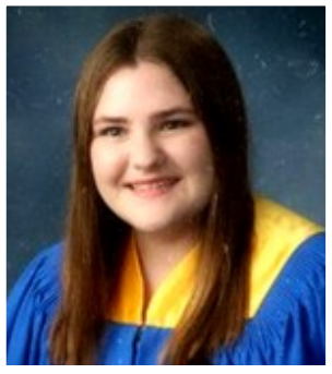
Madison Clinton Albany Centennial Club Kinkora Regional High